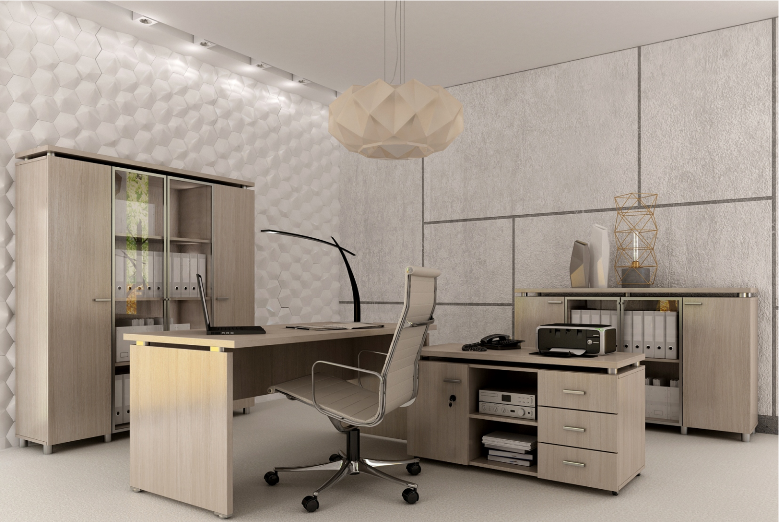
Dap urban oyster