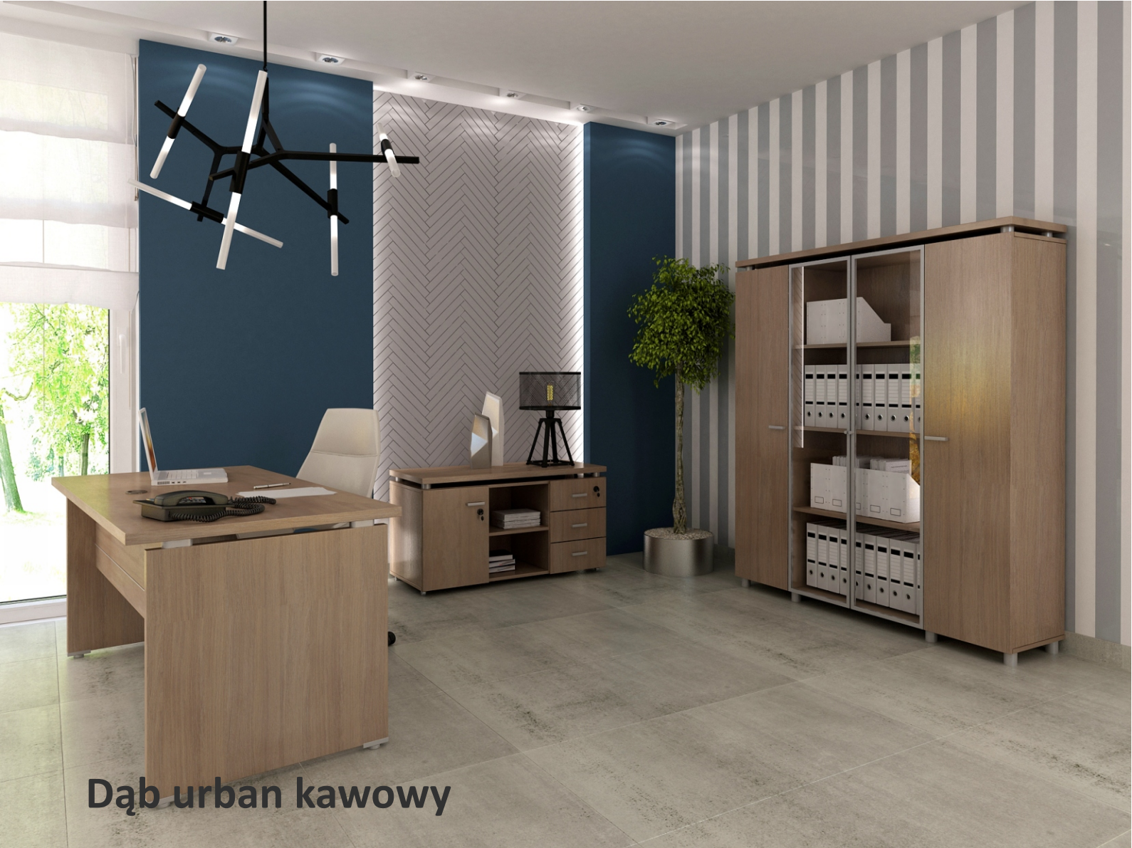
Dąb urban kawowy